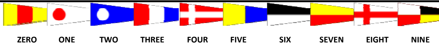
Course Chart IF-2017

ZERO ONE TWO THREE FOUR FIVE SIX SEVEN EIGHT NINE