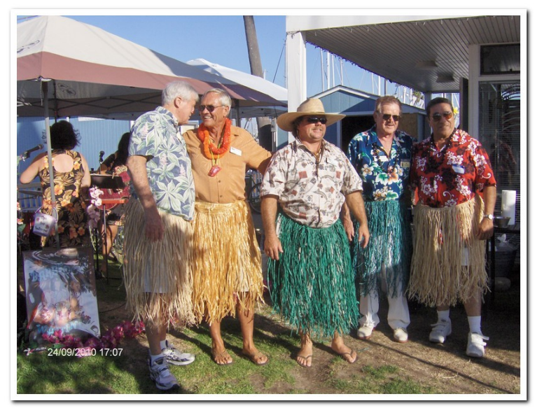
Grass Skirt Gang